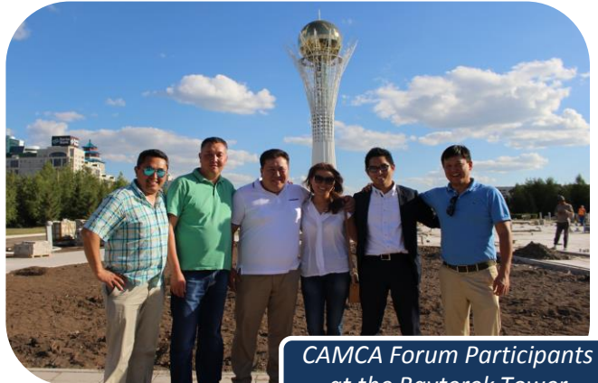
CAMCA Forum Participants at the Bayterek Tower