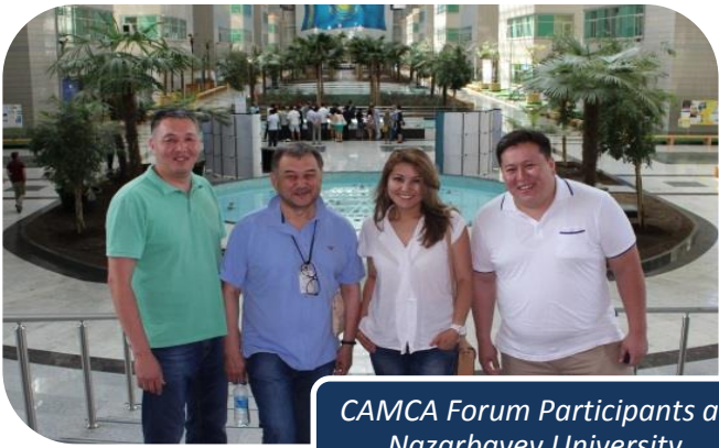
CAMCA Forum Participants at Nazarbayev University