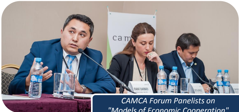
CAMCA Forum Panelists on "Models of Economic Cooperation"