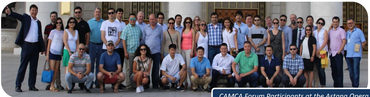
CAMCA Forum Participants at the Astana Opera