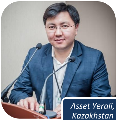
Asset Yerali, Kazakhstan