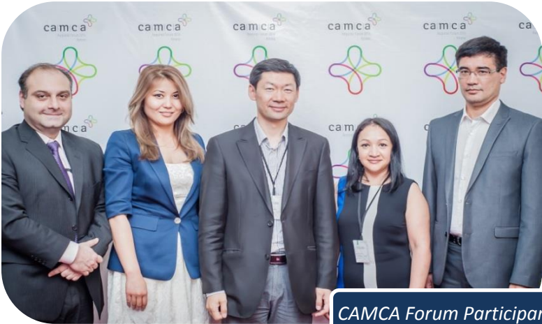
CAMCA Forum Participants