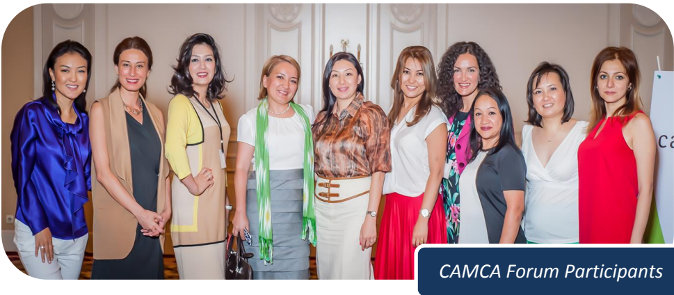
CAMCA Forum Participants