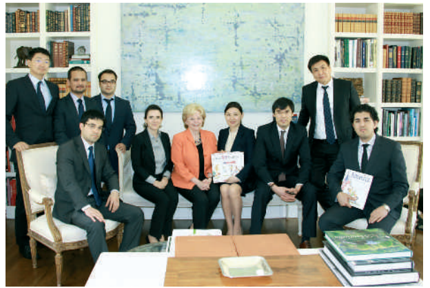
Spring 2013 Fellows with Lynne Cheney, author and former 2nd Lady of the United States

The last ten groups have also traveled to cities including Atlanta, Boston, Chicago, Dallas, Philadelphia, San Diego and New Orleans for high-level meetings, offering