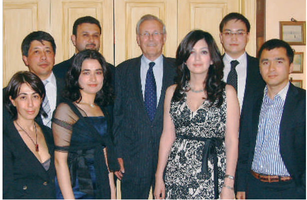
Spring 2009 Fellows with Donald Rumsfeld